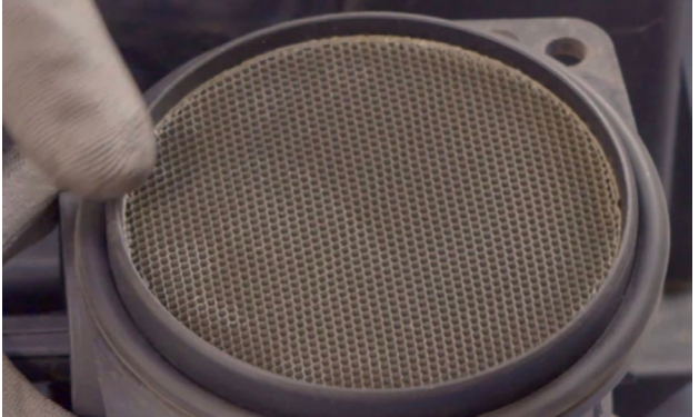
WALKER PRODUCTS DOES NOT RECOMMEND USING MASS AIR FLOW CLEANER AEROSOL SPRAY. DOING SO COULD DAMAGE THE MASS AIR FLOW SENSOR.