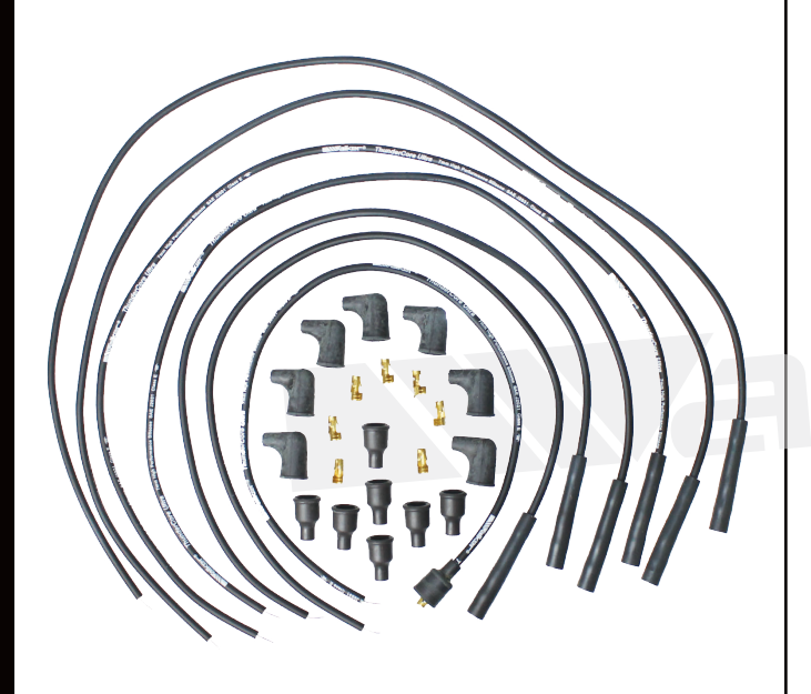
924-1552 Mag Core