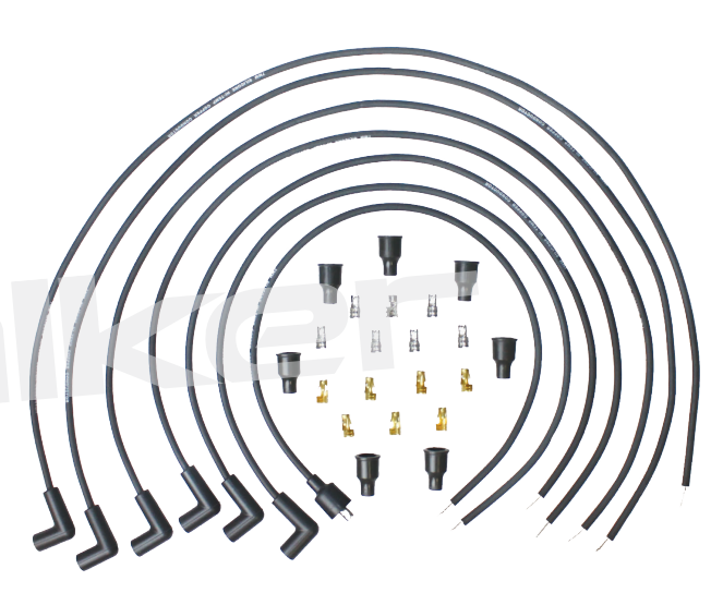
924-1557 Copper Core