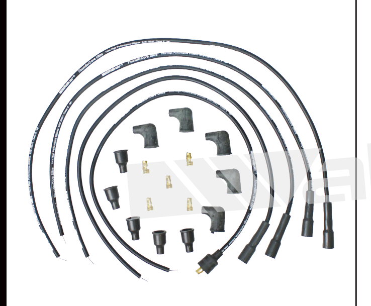
924-1550 Mag Core