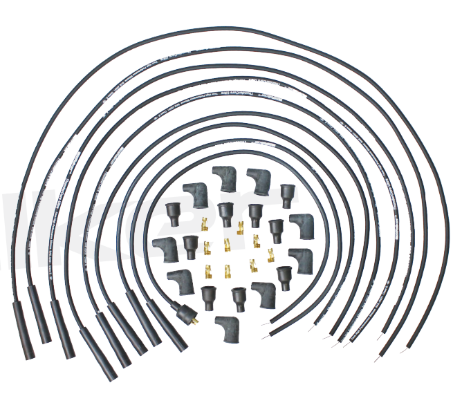
924-1553 Mag Core