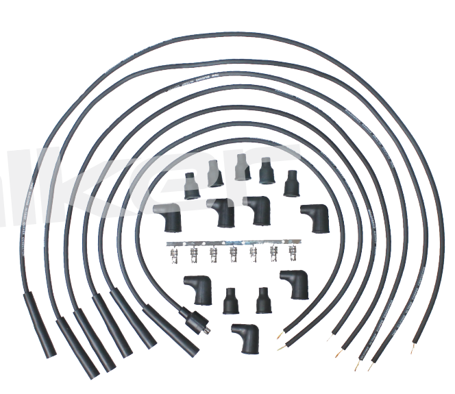
924-1555 Copper Core