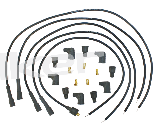
924-1551 Copper Core