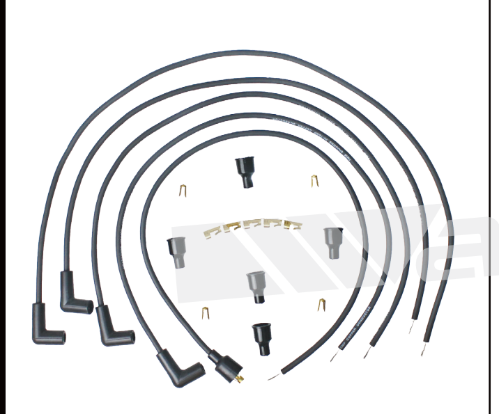
924-1556 Copper Core