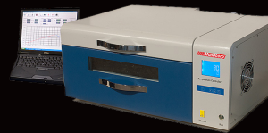
Bench Top Batch Reflow Oven