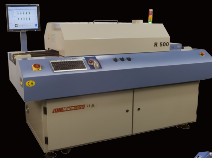
Production Reflow Oven