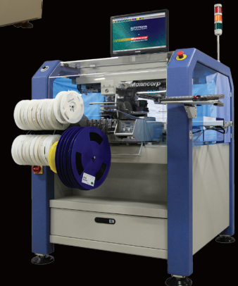
Pick and Place Machine