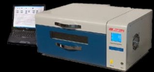
Bench Top Batch Reflow Oven