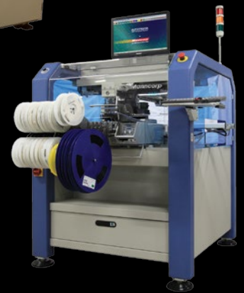
Pick and Place Machine