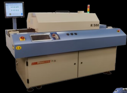
Production Reflow Oven