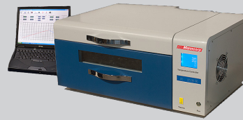
Bench Top Batch Reflow Oven