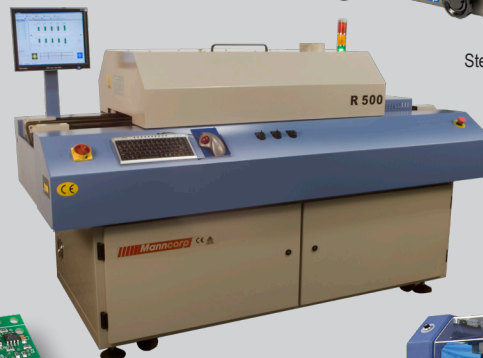
Production Reflow Oven