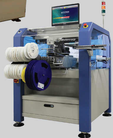
Pick and Place Machine