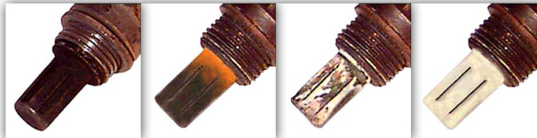
Rich Fuel Mixture

For the end user and repair shops performing a vehicle tune-up, remove the oxygen sensor and check for these symptoms: