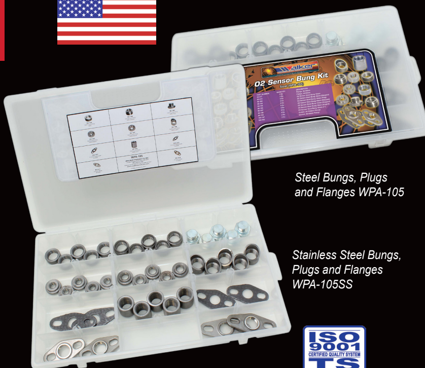
Steel Bungs, Plugs and Flanges WPA-105